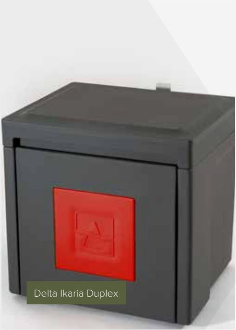
Delta Ikaria Duplex