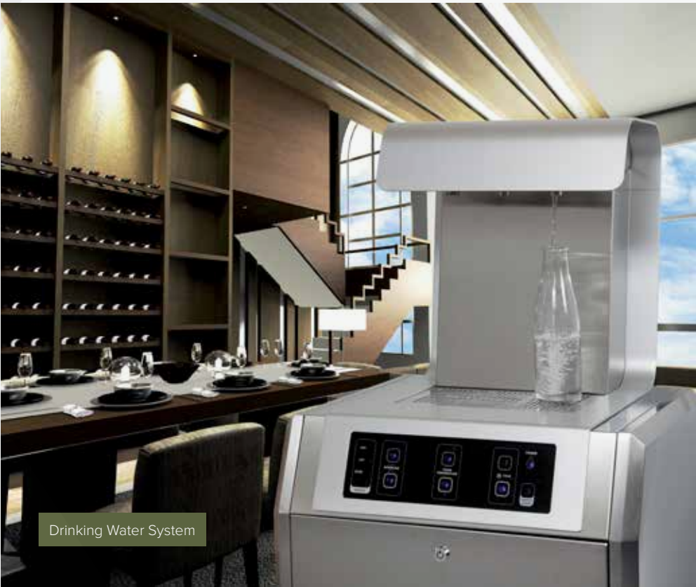
Drinking Water System