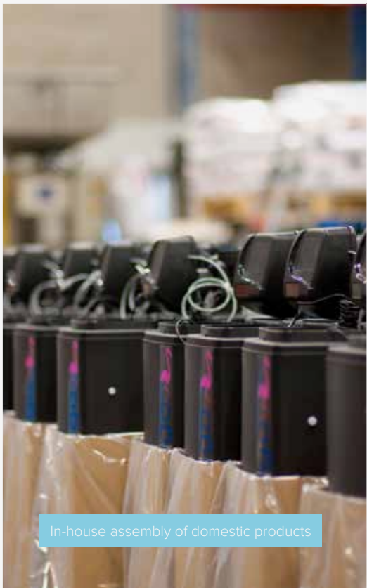
In-house assembly of domestic products