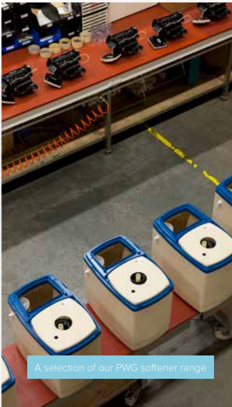
A selection of our PWG softener range