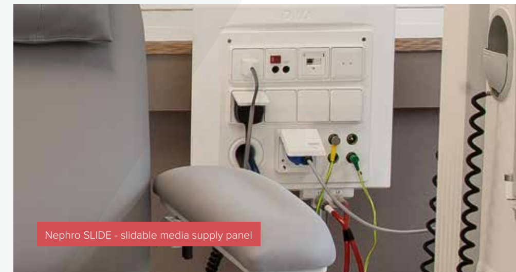
Nephro SLIDE - slidable media supply panel