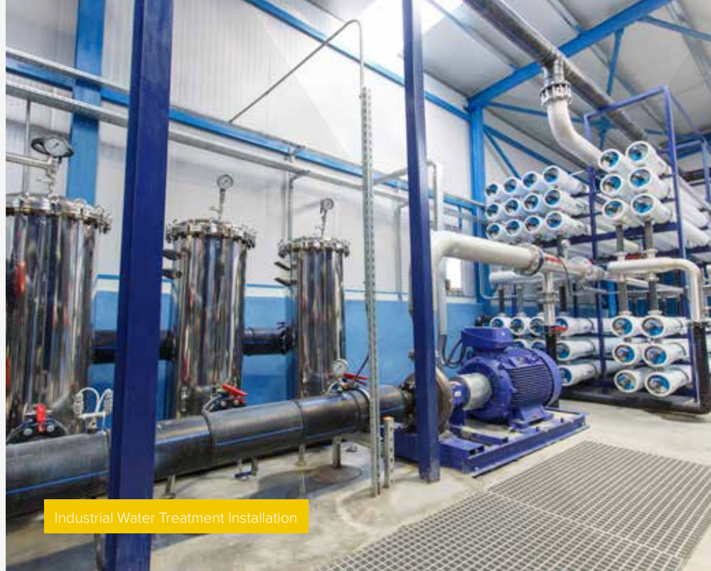
Industrial Water Treatment Installation