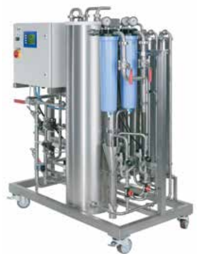
Modula S-XL - Reverse Osmosis System for high permeate flows and operational safety