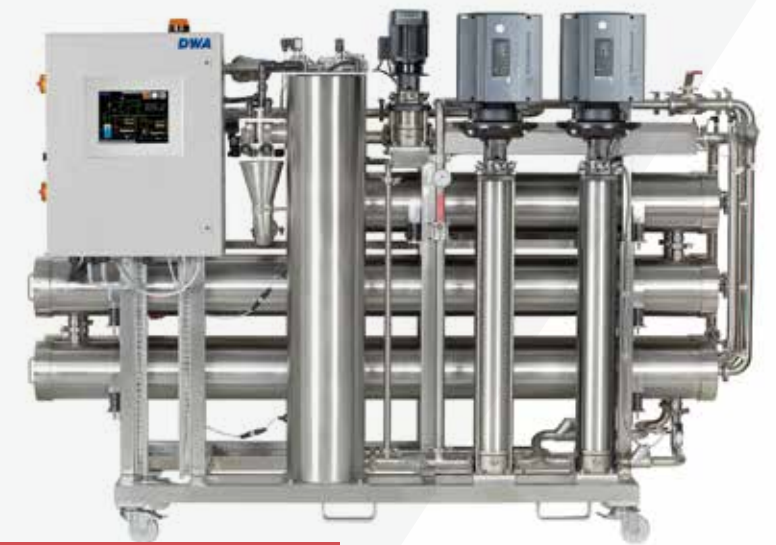
NephRO TP - Twin-pass reverse osmosis