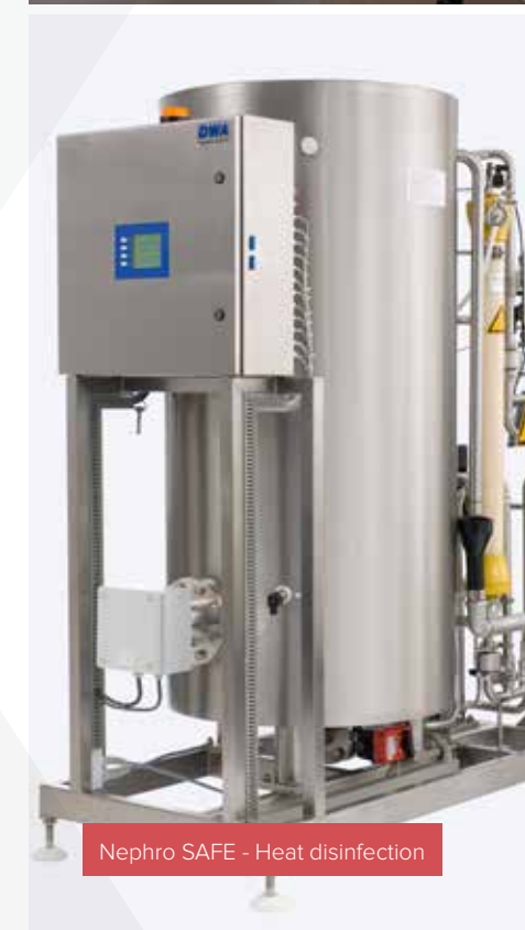
Nephro SAFE - Heat disinfection