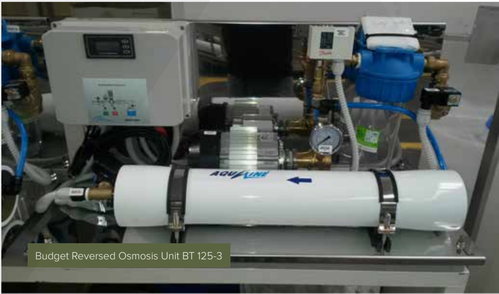
Budget Reversed Osmosis Unit BT 125-3