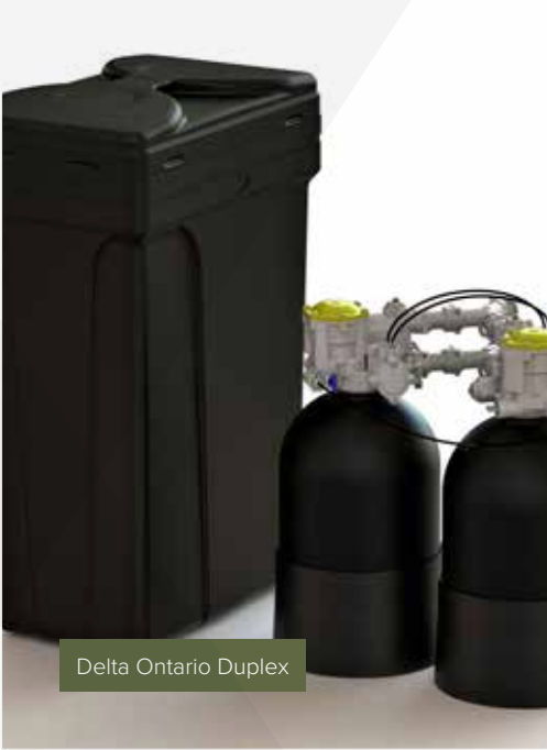
Delta Ontario Duplex