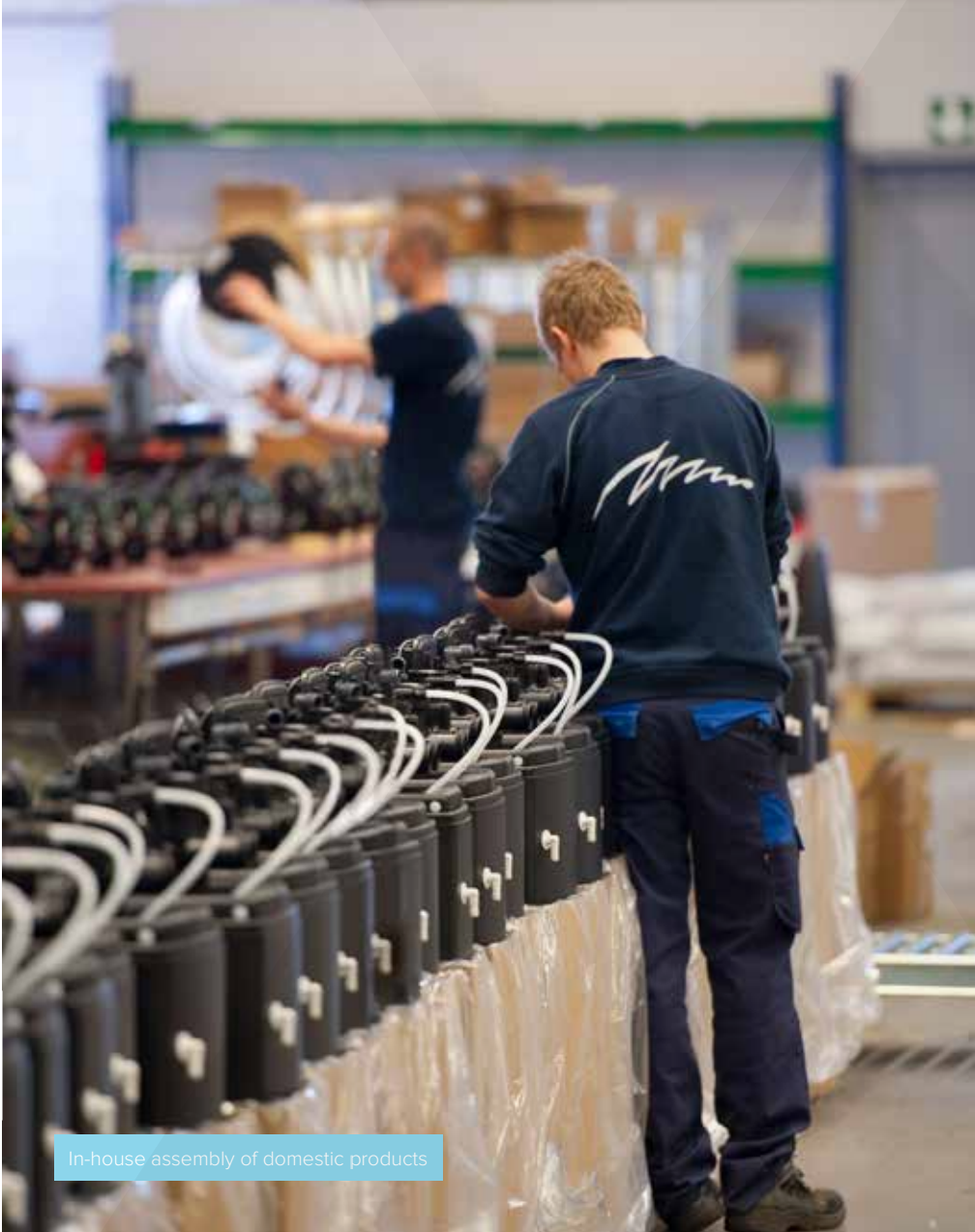
In-house assembly of domestic products